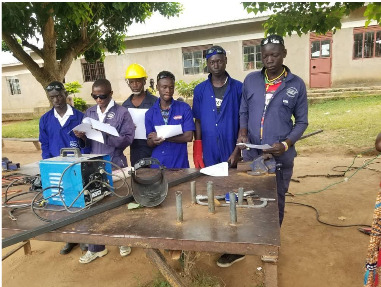
Leerlingen van Metaalbewerking: lassen.

Morkiswa Community Skilling Institute Nagongera Rd, Kisoko Sub-County P.O Box 803, Tororo, Uganda Ph +256 772529906, +256 759589664 e f.okech@morkiswacommunity.com w www.morkiswacommunity.com