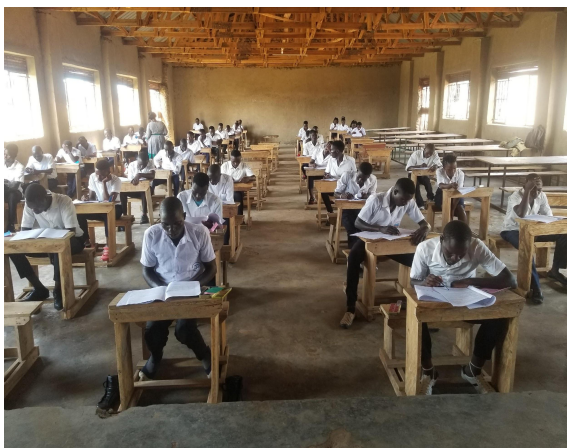
One of the national UBTEB examinations

All together we had 140 non formal students and 120 formal (national certificate) students in 2022. 30% of them were female and the rest were male students. 94 students were examined by Directorate of Industrial Training (DIT) and 120 (formal) students sat National Certificate examinations conducted by Uganda Business and Technical Examination Board (UBTEB).